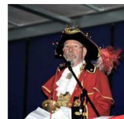
2011 Christmas Lights Switch on